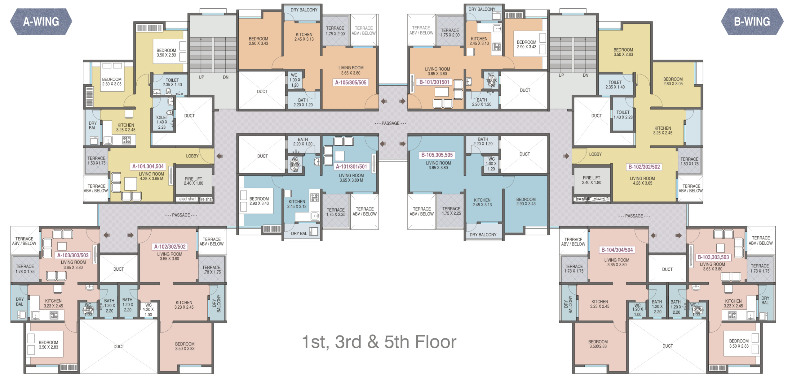
1st, 3rd & 5th Floor