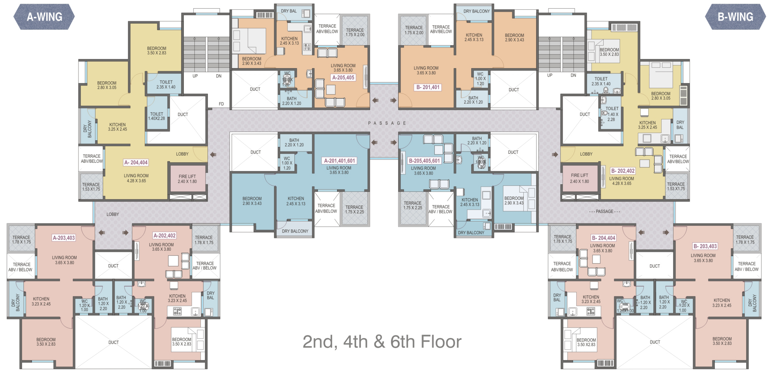
2nd, 4th & 6th Floor